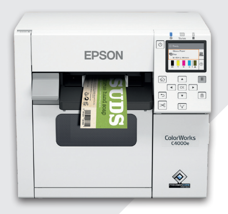
ColorWorks C4000e series